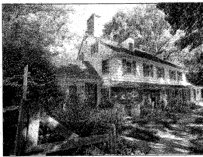
The historic Luke Miller House in Madison is being auctioned by the borough, but with guarantees that it will be preserved.