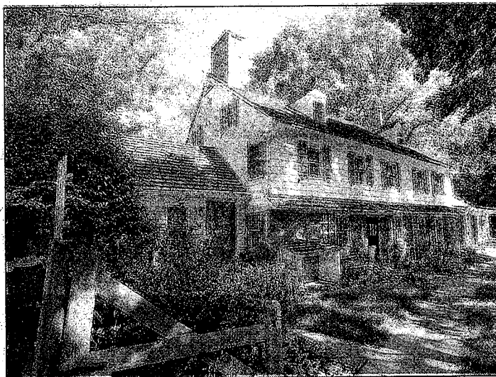
The historic Luke Miller House in Madison is being auctioned by the borough, but with guarantees that it will be preserved.