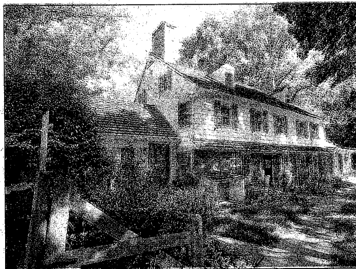
The historic Luke Miller House in Madison is being auctioned by the borough, but with guarantees that it will be preserved.